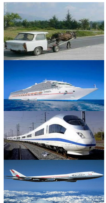
Means of transportation